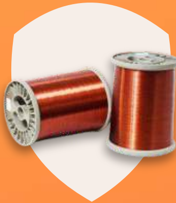
Enamel (SEM) Copper Conductors