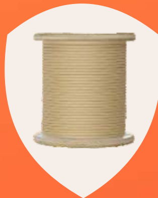
Paper Covered Aluminum Conductors