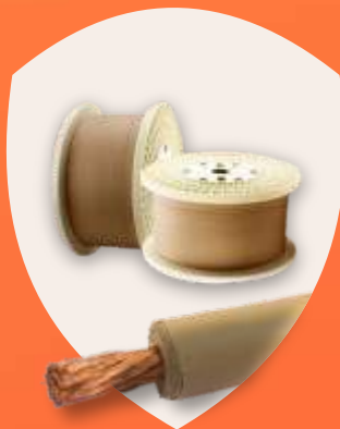
Paper Covered Copper Conductors & Bunched Conductors