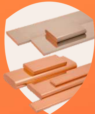
Copper Bus Bars/ Flats