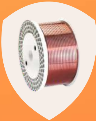
Enamel (SEM) Aluminum Conductors